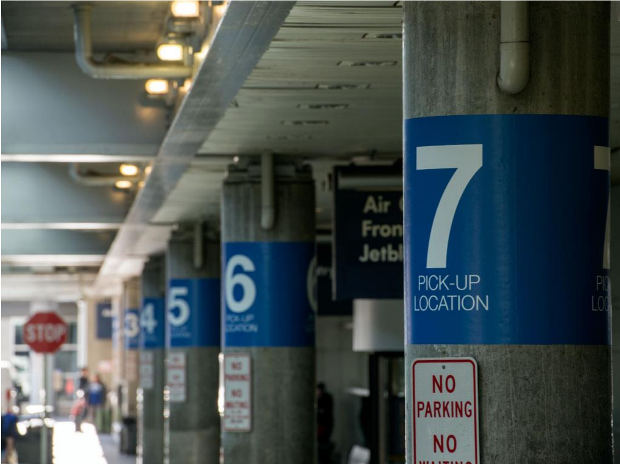
A view of the new column wraps.