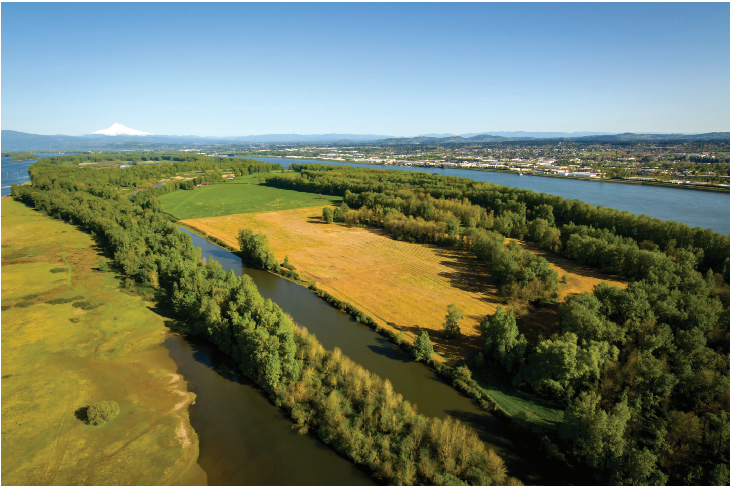
Government Island mitigation site preparation in progress