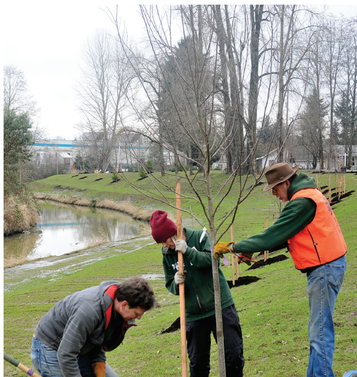
Elrod Slough restoration planting

Port staff conducted a focus group with committee members and the PDX International Air Service Committee regarding the PDX ticket lobby, seeking their opinions about how the passenger experience is evolving. PDX CAC members were also sent information on upcoming airport tree thinning projects and invitations to Port-sponsored community tree planting events.