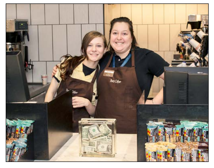
Coming off a plane, you usually have three priorities: 1. Find a bathroom. 2. Pick up your luggage. 3. Rehydrate. The new location of Peet's Coffee & Tea makes the last two easy - they're now conveniently located in baggage claim and open for business! Stay tuned for more new concessions, including even more coffee options, opening through the end of the year.