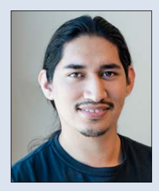
"I once spotted a very tall man – his height must have been around 7 feet! – wearing a bright neon blue onesie and walking on the moving platform. He definitely caught everyone's attention."

A few months back, we asked some of our TSA team members about the strangest things they've seen at PDX. Now we're asking more of our PDXperts for their most notable airport memories!