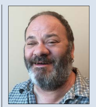
"I saw a guy driving into the long-term garage who became very confused and wound up driving out the wrong direction into oncoming traffic. It was scary and definitely memorable."