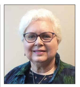
"I purchased a beautiful journal from Powell's for my granddaughter...but then I headed to The Real Mother Goose to buy some amazing earrings for myself!"