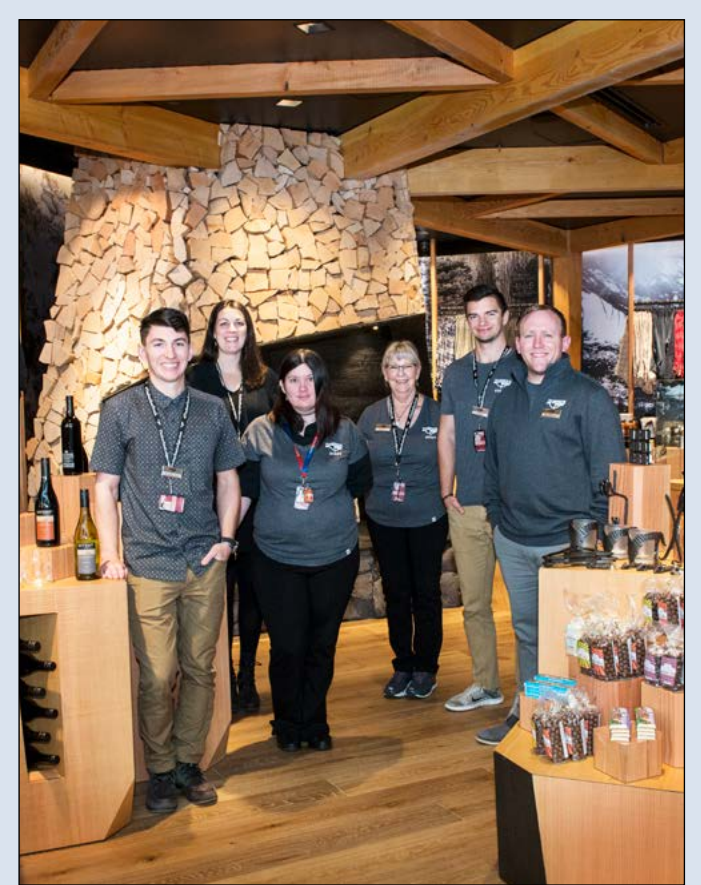
Timberline Lodge (Concourse D)

PDX has much to be thankful for this holiday season! November saw the opening of new concessions and the remodeling of existing locations, kicking off a transformation that will continue long into 2017. In this issue of PDXaminer, we give thanks for: The only airport distillery tasting room in the world, House Spirits; Pacific Northwest-focused apparel and souvenirs at Timberline; acai bowls and smoothies at Moberi; products from the state's finest artisans at Made In Oregon; and coffee products nurtured from seed to cup at Portland Roasting. Stay tuned for more openings in the next issue!