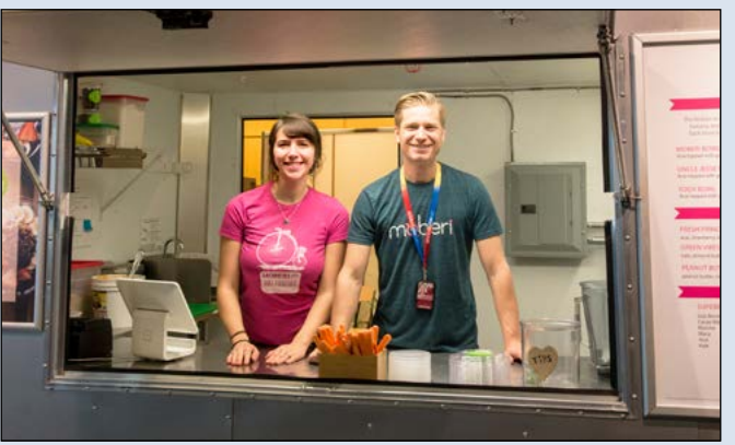
Moberi (Oregon Market)