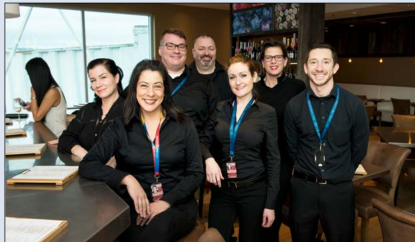
Vino Volo, Concourse C