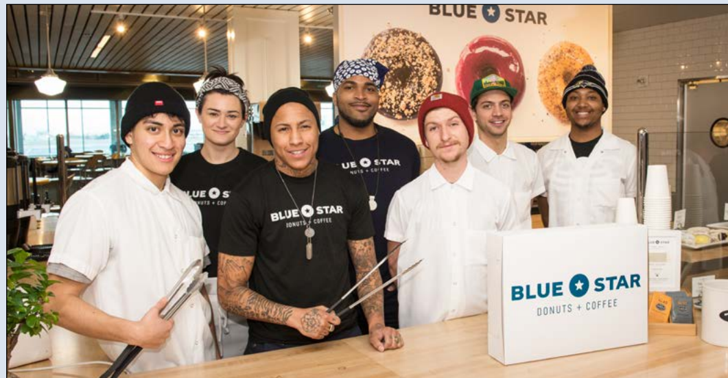
Blue Star Donuts, Oregon Market (pre-security)

The new year started with a bang as PDX welcomed a cadre of new concessions covering everything from deli to donuts. In this issue of PDXaminer, we're featuring the permanent location of the popular Capers Farm-to-Table Market ; old-fashioned bagels, soups and sandwiches at Kenny & Zuke's Delicatessen & Market ; a selection of wines from the Pacific Northwest and beyond at Vino Volo ; the latest in mobile accessories, entertainment devices and hardware at a remodeled Soundbalance ; baked goods, breakfast sandwiches and beverages at two new Starbucks locations; and beloved brioche-based treats from the artisan Blue Star Donuts , whose Cointreau concoction is guaranteed to clear TSA checkpoints.