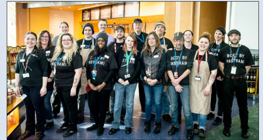
Kenny & Zuke's Delicatessen and Market, South Lobby