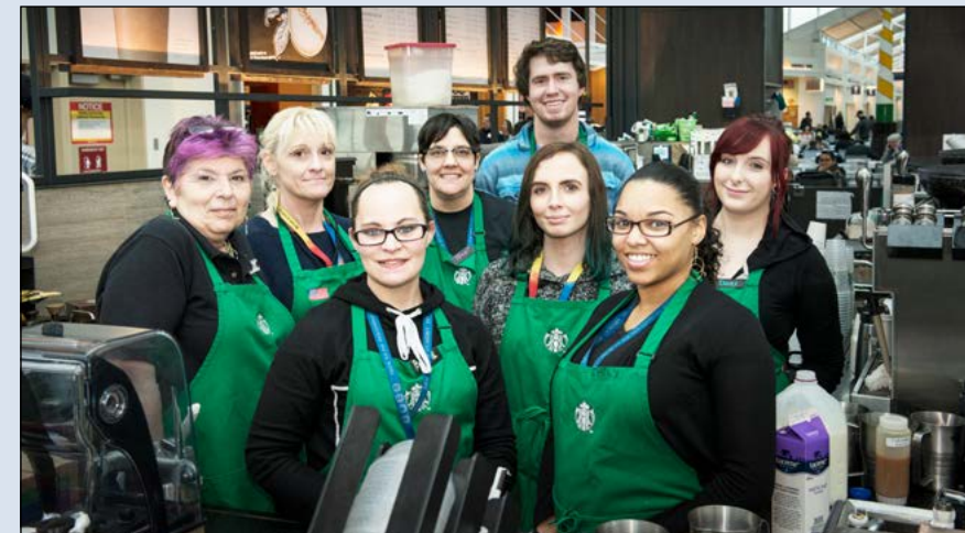
Starbucks, Concourse C