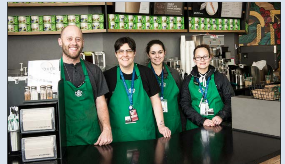
Starbucks, South Ticket Lobby