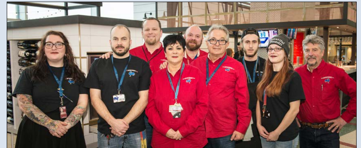
Capers Farm-to-Table, North Lobby