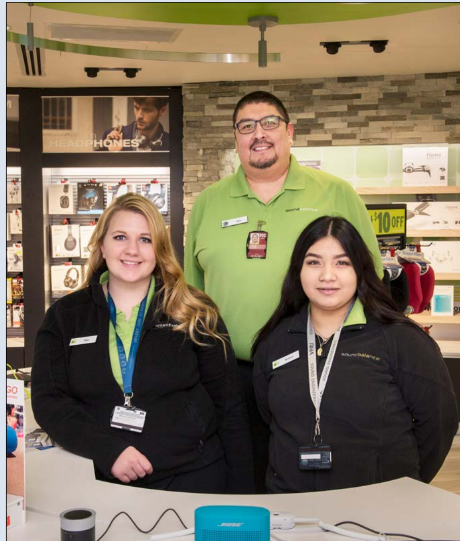
Soundbalance, Concourse C