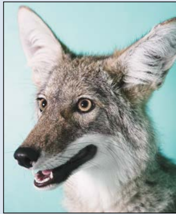
Luminus Nature, Concourse A

Want to learn more about the many artists on display at PDX? Visit our PDX Art Blog at pdxart.portofportland.online .