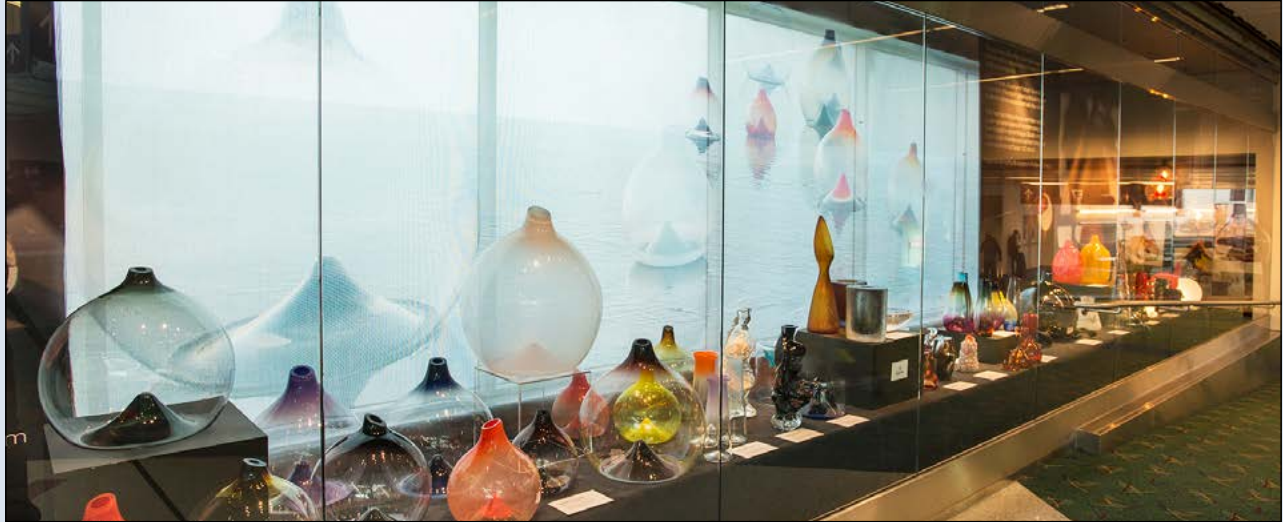
Esque Studio, Concourse D/E intersection