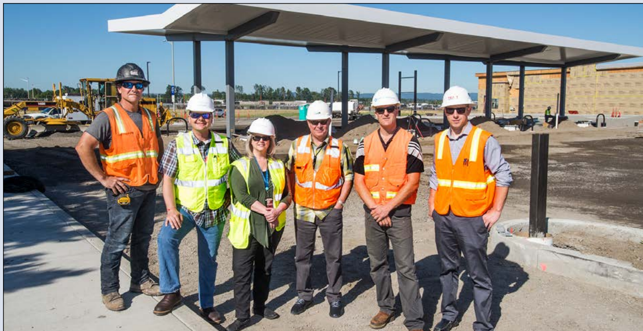
This PDX team is supervising construction activities for the new travel center located at Northeast 82nd and Air Cargo Road, which is expected to open in August.

Given that the only guaranteed time for good weather in Portland is during the summer – and even that’s not a sure thing! – you can imagine that it’s a busy season for construction at PDX. With so many projects underway, here’s a quick guide to three things you need to know to navigate mall walls and paving projects.