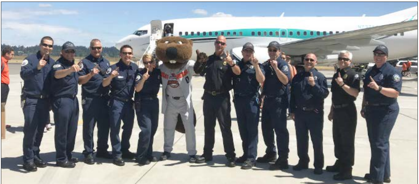
When the Oregon State Beavers returned from the College World Series in Omaha, Nebraska, our Portland Airport Fire and Rescue team was ready to greet them with a congratulatory water arch and pic with mascot Benny the Beaver. Congrats to the winners, who beat the Arkansas Razorbacks 5-0 to clinch their third national championship of the century. No other NCAA Division I college baseball team has had as many titles since 2000!