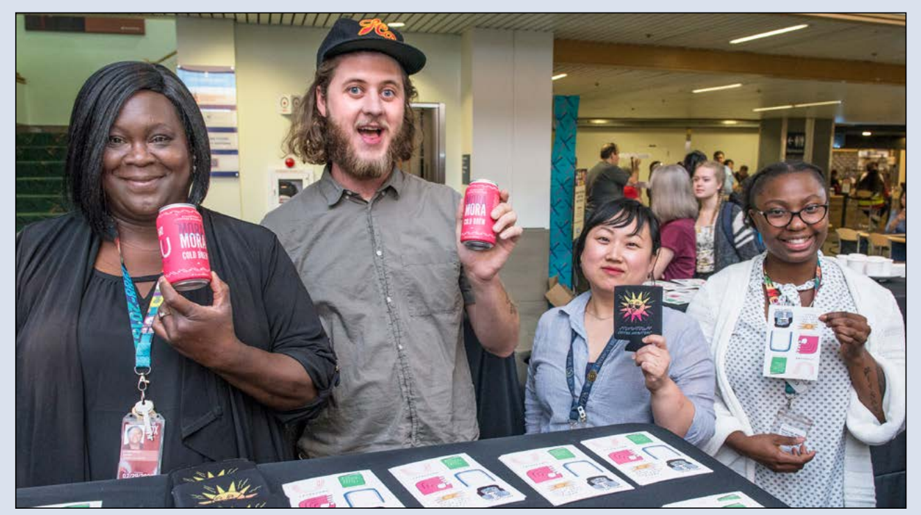
Thanks to everyone who joined in the fun of Feast Fridays at Clocktower Plaza in August. Whether you bit into a Kenny and Zuke's Delicatessen Bahn Mi, demolished a Deschutes Brewery Backyard BBQ burger, chowed down on The Country Cat's custom BLT or sipped Stumptown Coffee Roaster's canned cold brew, we can't think of a tastier PDX partnership.