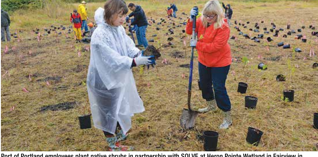
Port of Portland employees plant native shrubs in partnership with SOLVE at Heron Pointe Wetland in Fairview in November 2015. The native plants will diversify this wetland, protecting the health of Fairview Creek, which drains to the Columbia Slough.

Discussions with researchers and other groups restoring prairies in Oregon, such as the Institute for Applied Ecology, Xerces Society, The