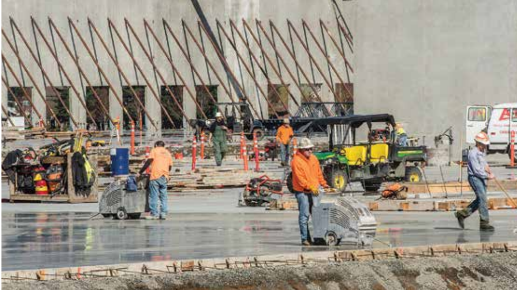
Subaru master parts distribution center takes shape at Gresham Vista Business Park.

The project is visible from Northeast Marine Drive near 223rd Avenue and was formerly home to the Reynolds aluminum plant and later declared a Superfund site. The Port acquired the property in 2007 and completed Phase I in 2010. FedEx Ground, the first tenant, constructed and