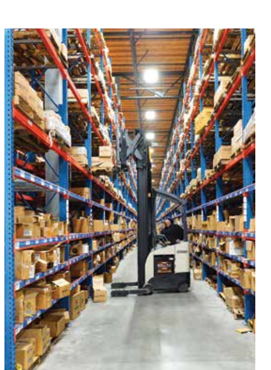
KeHE Distributors in PDX Logistics Center.

Support to shippers currently underway includes the creation of a drop yard for the monthly Westwood Shipping Lines container service at Terminal 6, the restart of an upriver barge-rail shuttle to connect with farmers in eastern Oregon, southeastern Washington and Idaho; and exploration of both a container reuse pilot and intermodal rail facility for mid-Willamette Valley shippers. The full report is available at www.oregontradesolutions.com.