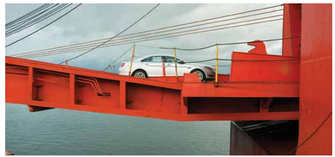
Ford exports to Korea and China through Port of Portland are expected to continue increasing.