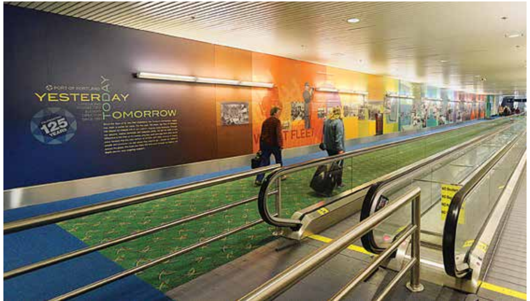
Port of Portland's 125 years of history is now on display at Portland International Airport.

"We're not what you'd expect" is the theme