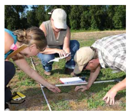
Port staff conduct a vegetation survey.

Both grassland diversity and associated pollinators are topics of conservation concern in the Portland metropolitan area; many organizations collaborate through the Intertwine Alliance's Oak Prairie Work Group.