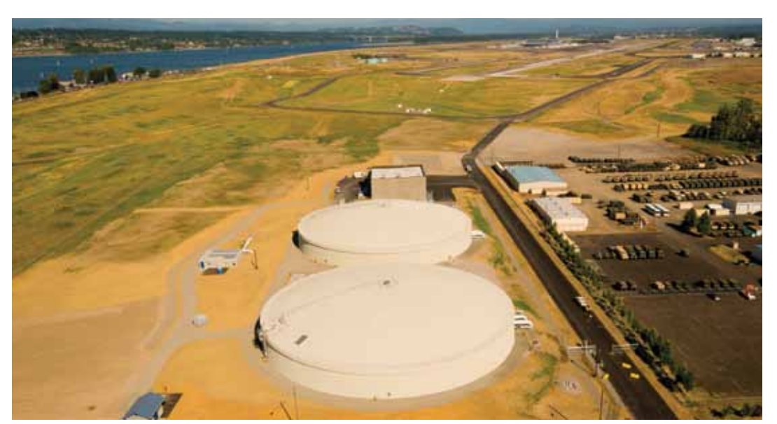
A number of large multi-year Port projects were completed in FY 2010-11. They include the extension of the north runway, the baggage screening improvement project, and airfield deicing system enhancements (shown above), at PDX as well as the completion of the Columbia River channel deepening.

The Port's fiscal year runs July 1 through June 30. Ninety-six percent of Port revenues come from user-based fees for service including