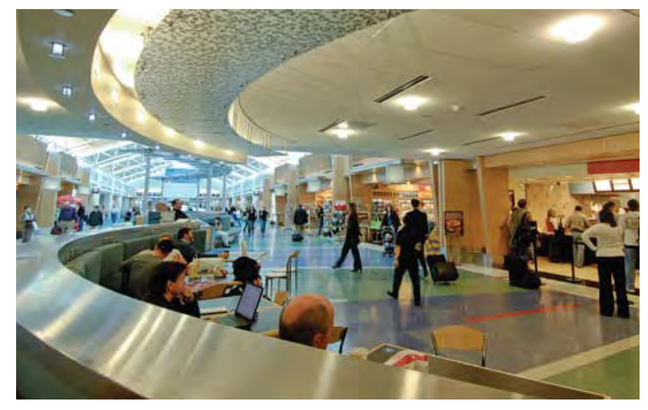
Sweeping new improvements to Concourse D offer travelers a cluster of remodeled restaurants and shops, brand new dining choices, comfortable seating areas, improved lighting and more computer hookups.

Richard Holdaway is a frequent flyer – 100 trips a year through the airport. "PDX is unquestionably the best airport in the U.S." he wrote;