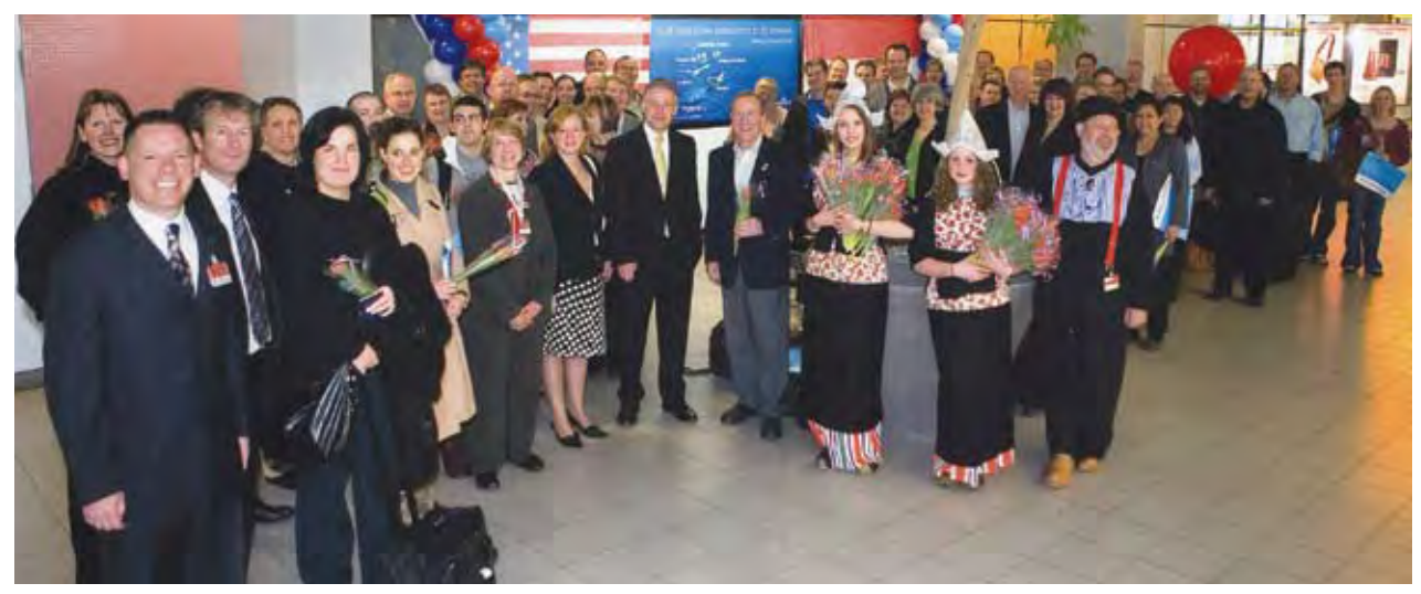
A warm Dutch greeting delights Oregon's governor and representatives from many Northwest businesses as they arrive in the Netherlands.

The Port's existing air quality program, developed in 2000, has focused on reducing greenhouse gas emissions and hazardous air pollutants generated in its marine and aviation operating areas. The Port's previously conducted air emissions inventories have helped identify areas of improvement, resulting in numerous projects that have reduced idling and fuel consumption, increased the use of lower-carbon alternative fuels, and emphasized the use of ultra-low sulfur diesel throughout the marine terminals