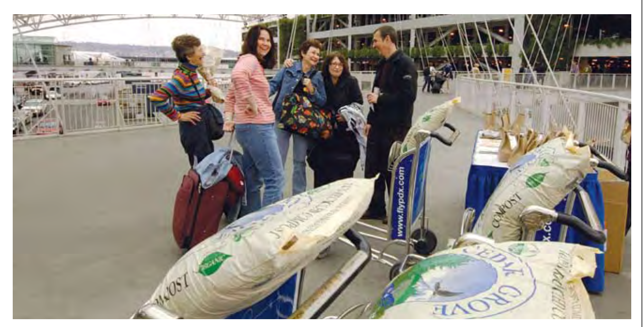
At a PDX Earth Day event, Port staff give away 200 bags of compost made, in part, from airport restaurant food waste.

This interim work will remove or isolate the highest-concentration contaminated sediments from the busy marine terminal, which handles automobiles, soda ash and liquid bulks. Other facets of the T-4 plan, most notably the construction of a confined disposal facility, will not occur until studies from the harborwide site study are completed. The Port is actively involved in the harborwide study and remains committed to cleaning up its contribution to Portland Harbor contamination.