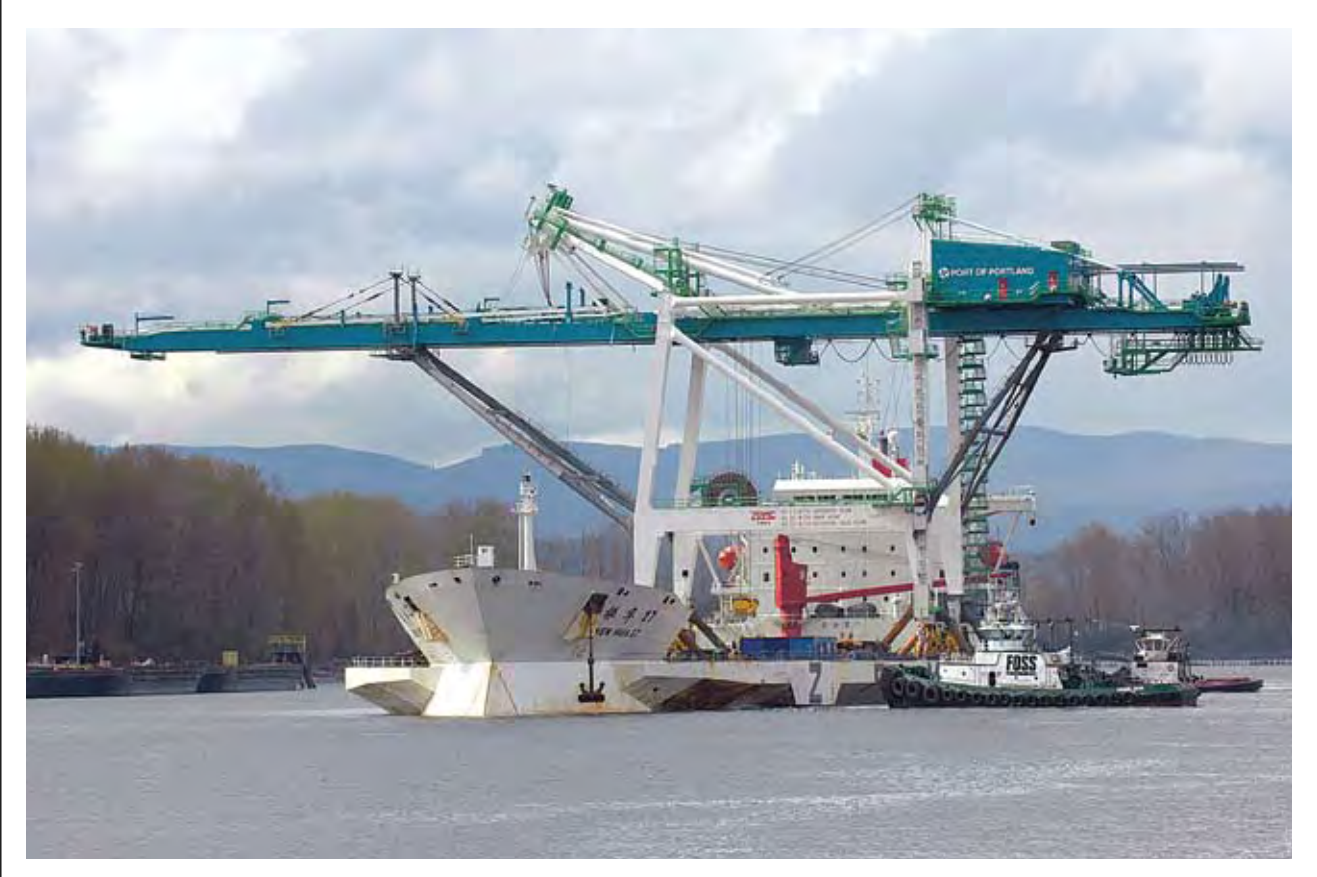
The new post-Panamax container crane makes its final approach to Terminal 6 following a month-long journey from China.

In a whirlwind visit to Portland on May 19, Klein toured the marine terminal facilities, met with Port marine customers, and attended a lunch where he talked with Port employees about maritime security