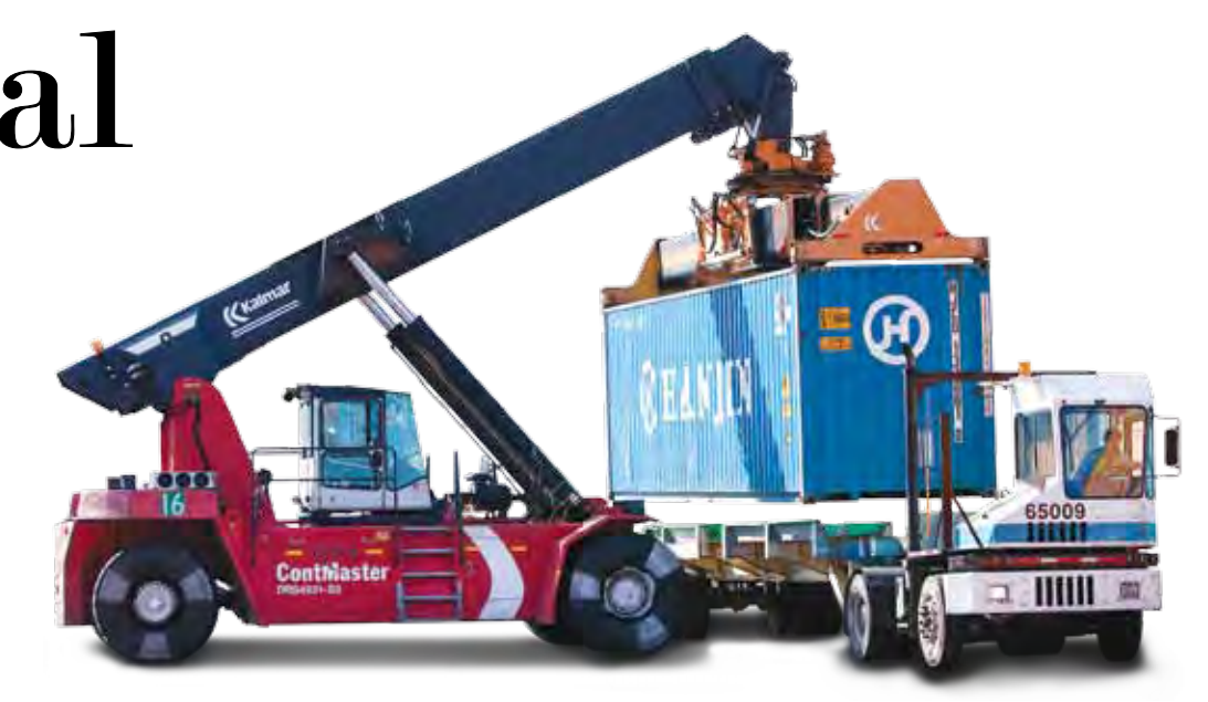
Since 2005, the Port has fueled container-handling equipment with ultra low sulfur diesel and improved exhaust systems for cleaner emissions.

process, were more stringent than existing water quality regulations. The outfall is also designed to physically keep fish away from its exits, which are called diffuser ports.